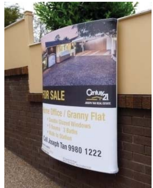
Big & Bold