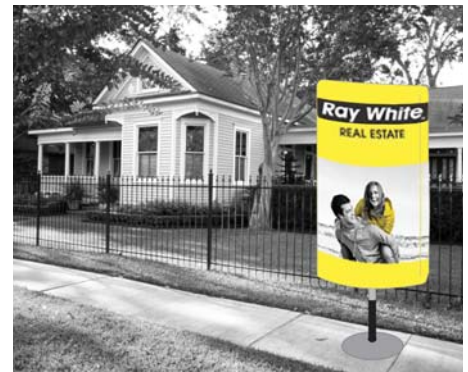
Light Box E