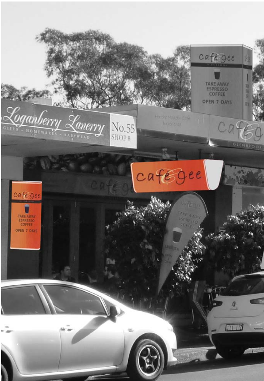
Light Box Vertical A