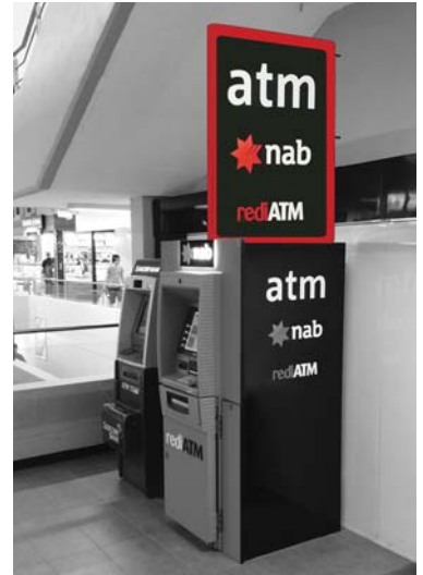
Light Box A