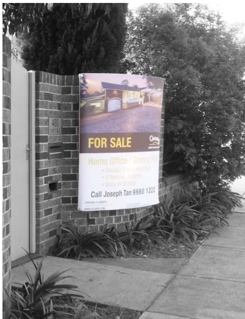
Solid & Sturdy